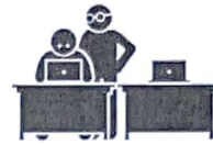
Solving Problem Together