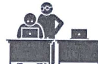
Solving Problem Together