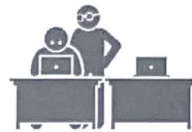
Solving Problem Together