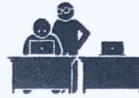
Solving Problem Together